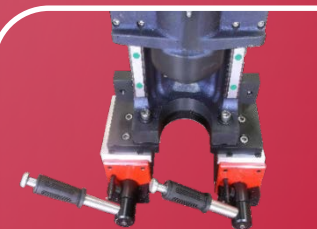
Switch magnet mounting option