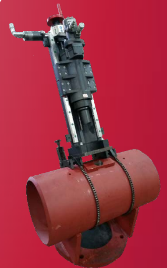
Chain clamp mounting option