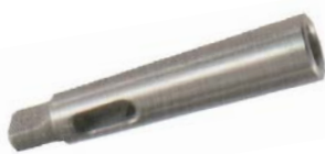
Morse Taper Sleeves