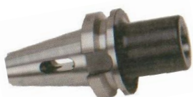
ISO50 Standard Spindle Tooling